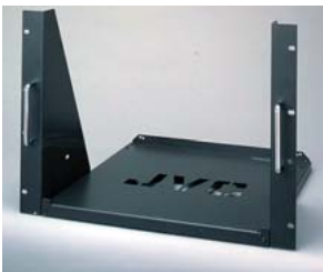
RK-C1700E ■ EIA Rack Mount Adapter